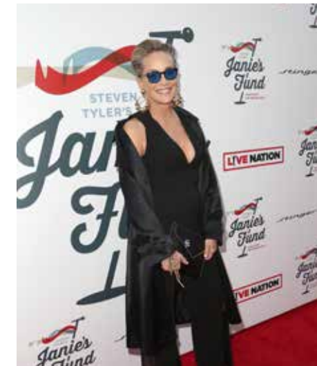
Counter clockwise from top: Steven Tyler w/ the girls of Sesa Wosuban, Jason Sudekis and Olivia Wilde, Sharon Stone.