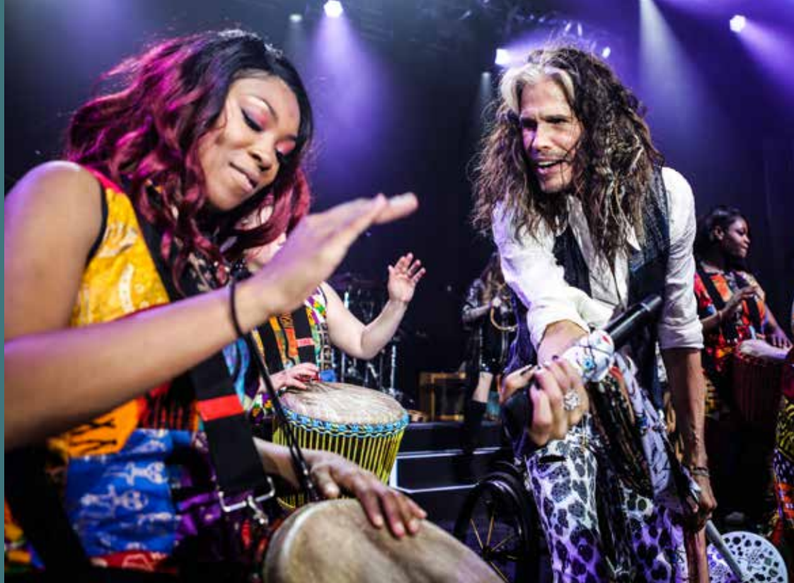
Steven Tyler